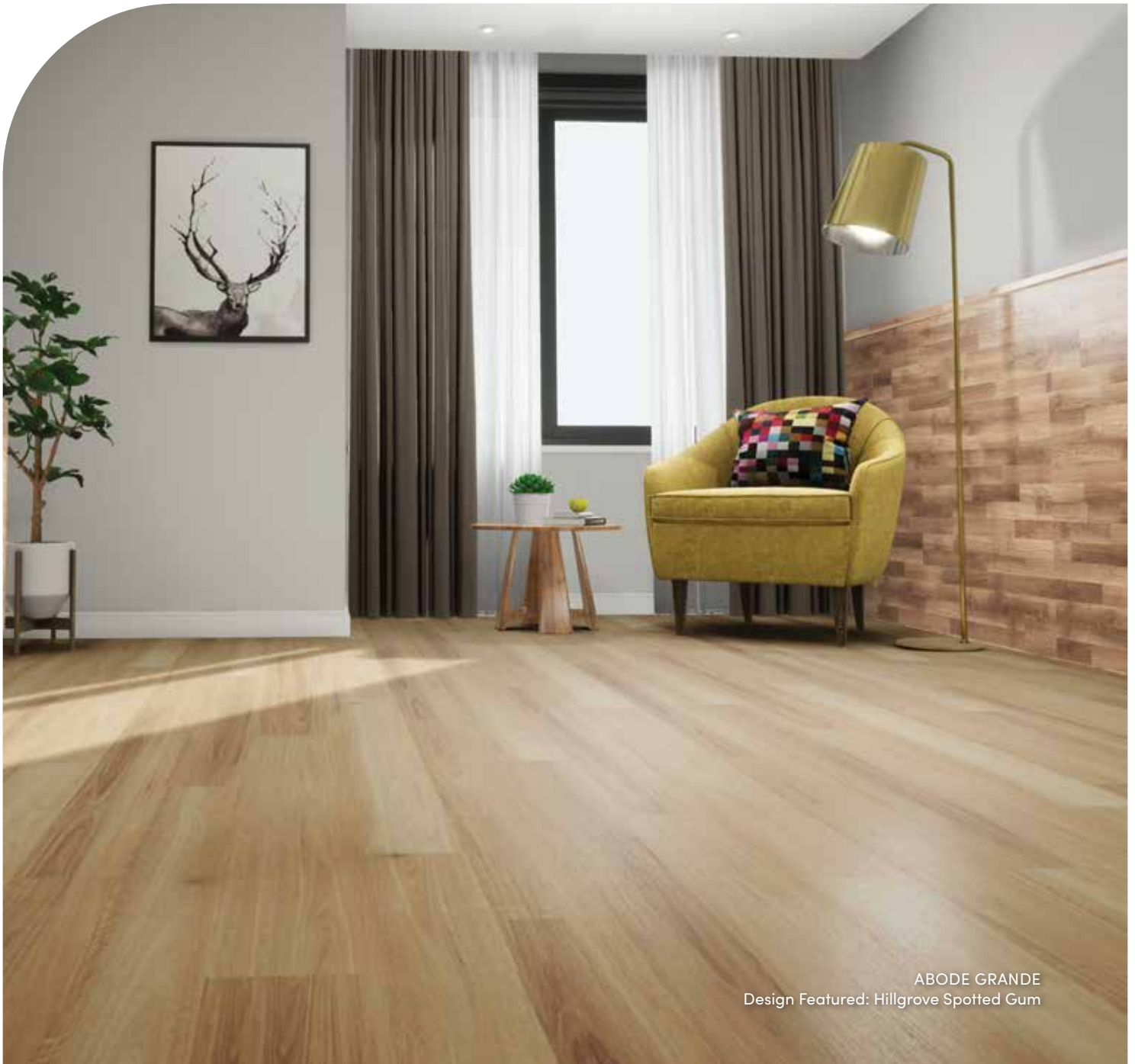
ABODE GRANDE Design Featured: Hillgrove Spotted Gum

A superior benchmark in rigid flooring, Abode Grande is sophisticated in style and with its beautiful colour hues, quality and ease of installation, its the perfect flooring solution for your home.